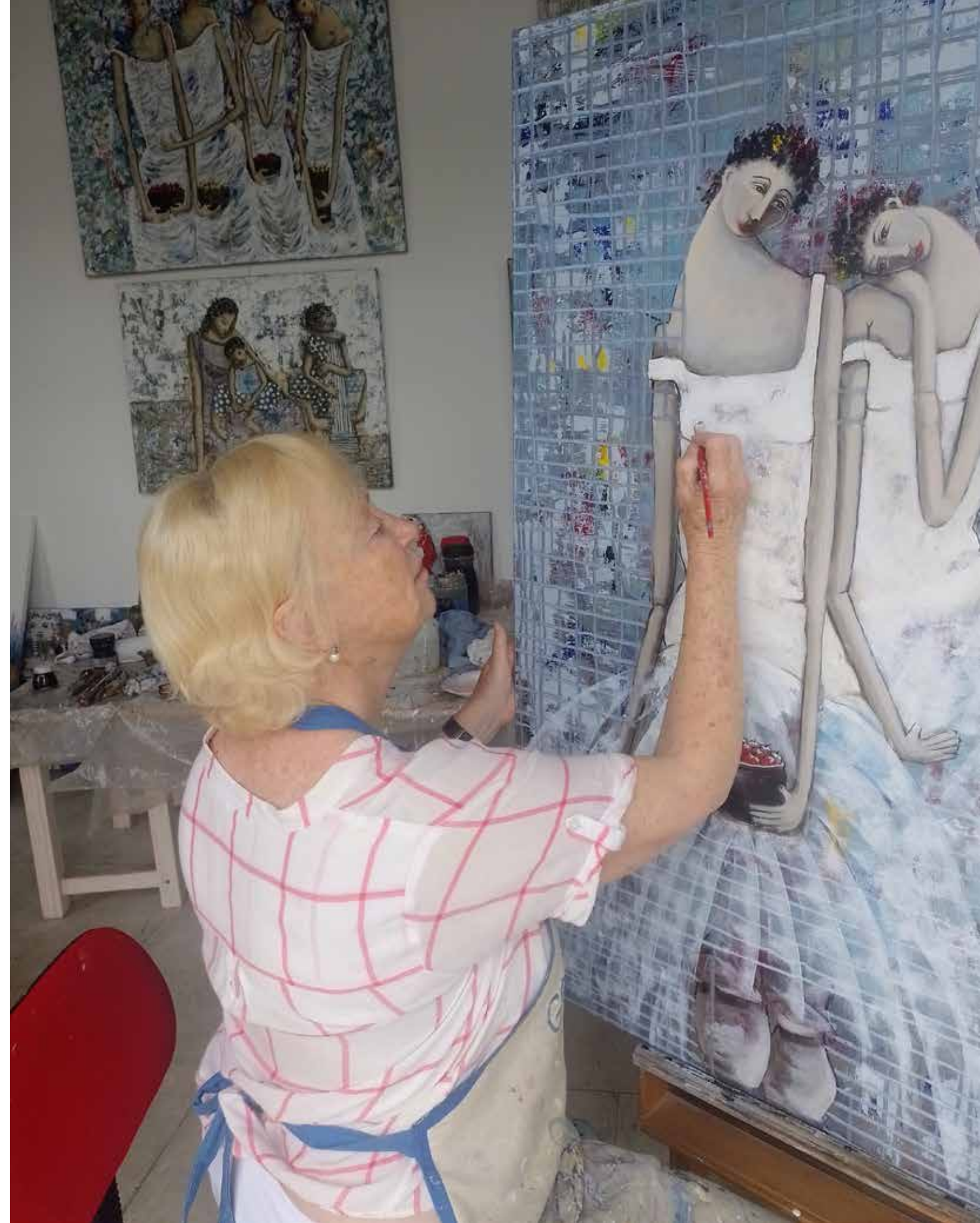
La artista pintando en su atelier