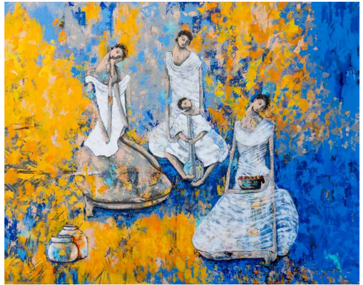
De la Serie Las Piadosas, 120x150 cm acrylic on canvas, año 2023

Enriqueta Aguiló is not simply an artist of today; she is a visionary whose works will continue to resonate tomorrow. She teaches us that painting can be at once philosophical and sensual, intellectual and emotional, rooted in history yet vibrantly contemporary. In her luminous canvases, destiny and beauty meet, and in that meeting, viewers discover not only the essence of art but also the essence of themselves.