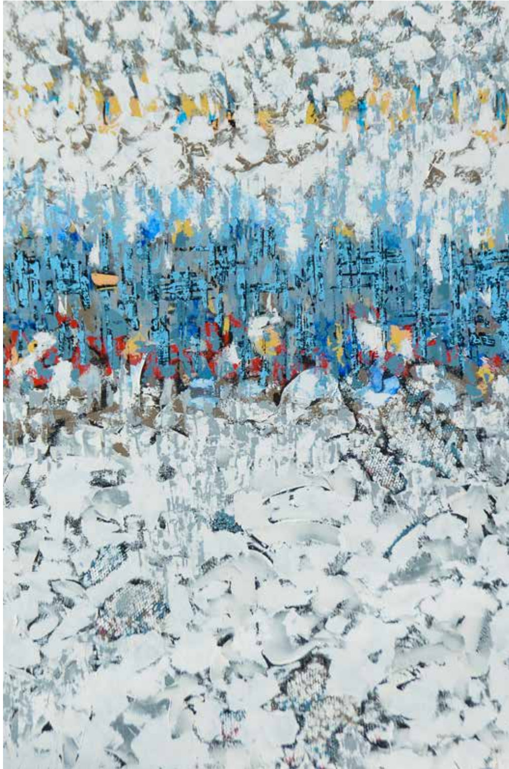
De la serie Ataraxia, acrylic and mixed media on canvas, 150x100cm. año 2019