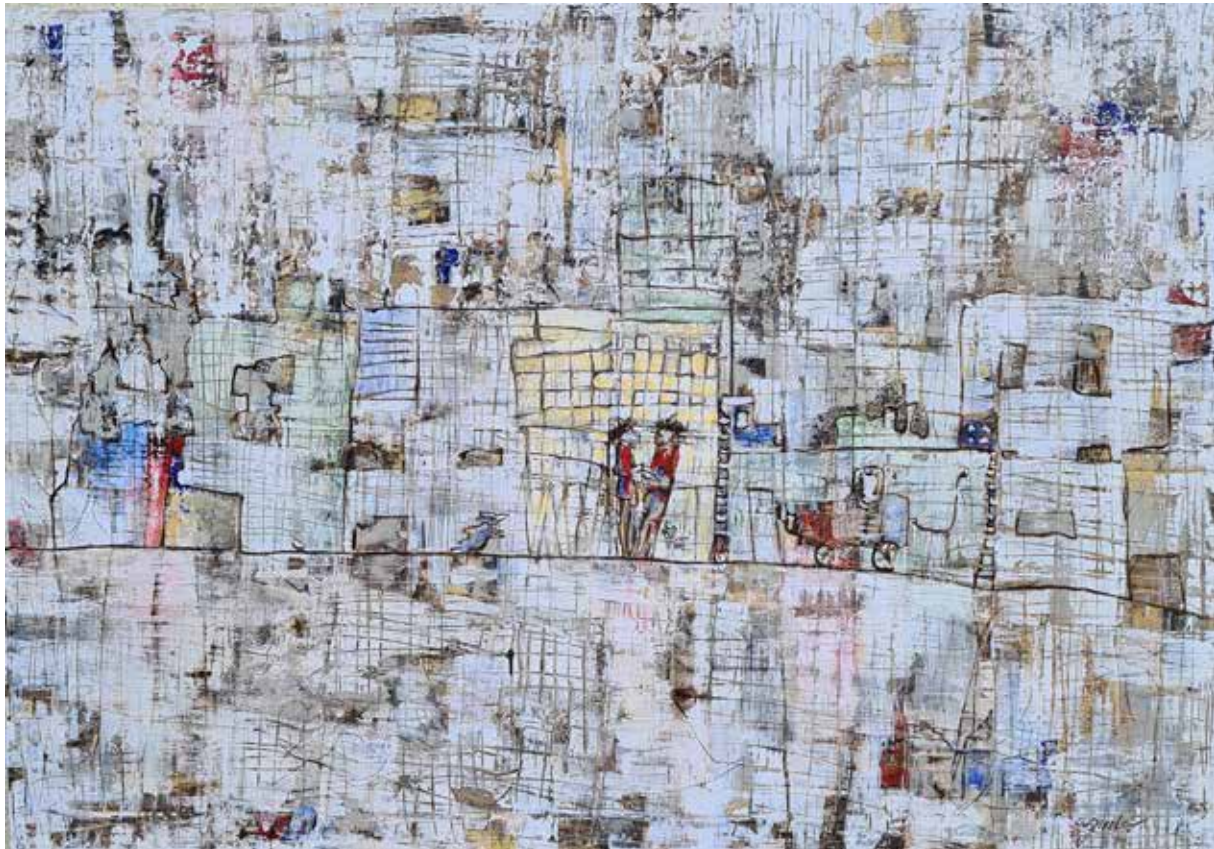
De la serie El Mundo de Lulú, acrylic on canvas, 70x100 cm. año 2015