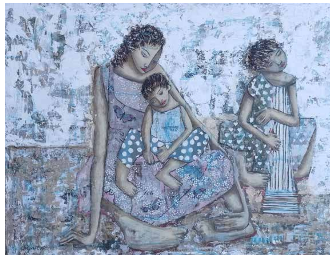
De la serie Las Piadosas, acrylic on canvas, 90x110 cm año 2022

Through creating, I have learned that each human being is utterly unique and irreplaceable, and that this diversity enriches the world. I’ve discovered the importance of patience — with others and with myself — and that if we are given a gift, it is meant to be shared as a way of connecting with others. I’ve also learned to be kind and compassionate with myself, because only then can I offer genuine love to those around me.