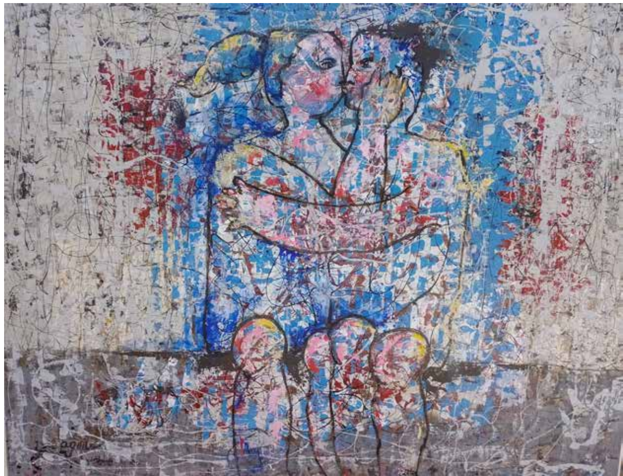
De la serie El Mundo de Lulu, acrylic on canvas, 80x100 cm. año 2023