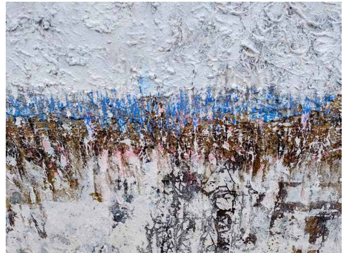
De la Serie Ataraxia AT 0026, acrylic on canvas, 100x120 cm. año 2022