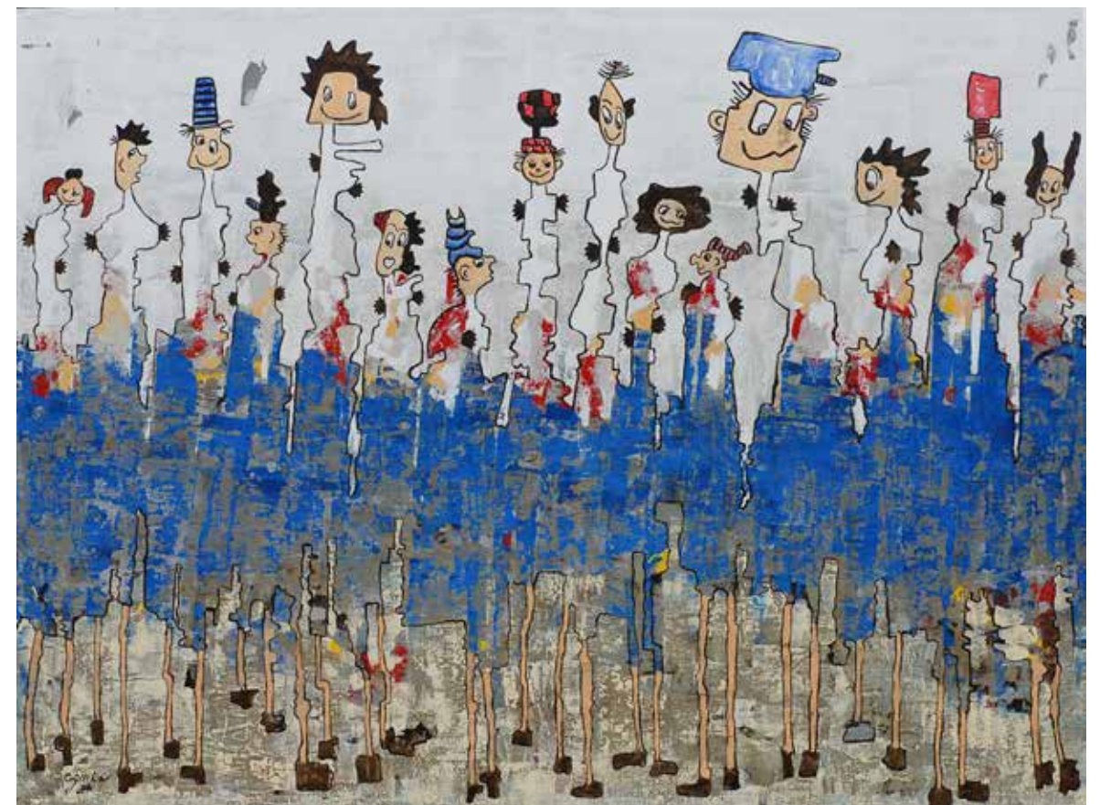
De la Serie El Mundo de Lulu acrylic on canvas 90x120 cm. año 2015