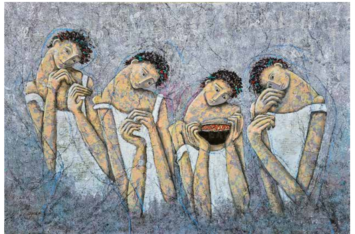
De la Serie Las Piadosas, acrylic on canvas 100x150 cm. año 2025