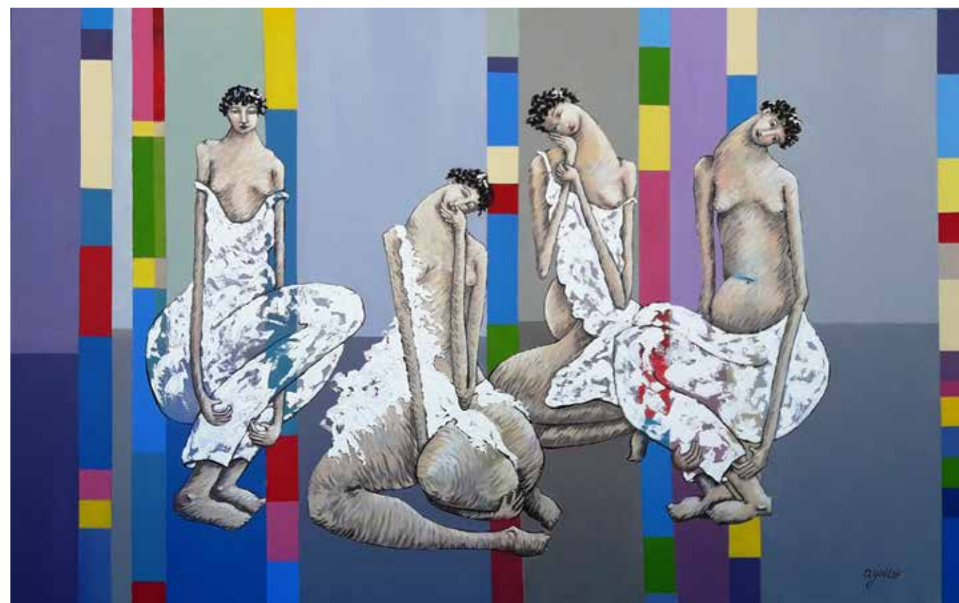
De la Serie Las Piadosas, acrylic on canvas, 100x150 cm. año 2020