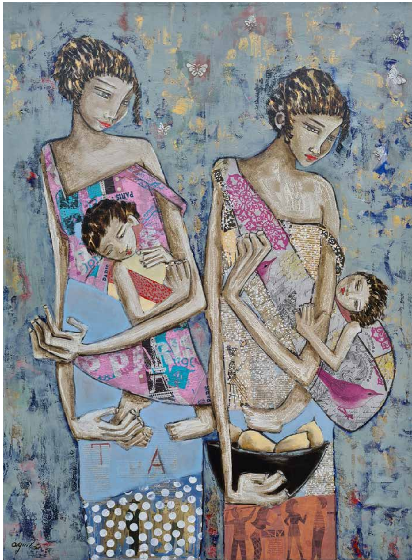
De la Serie Las Piadosas, mixed media on canvas 90x70 cm. año 2018

Q: Is there an image, symbol, or idea that recurs in your work that you haven't yet fully decoded?