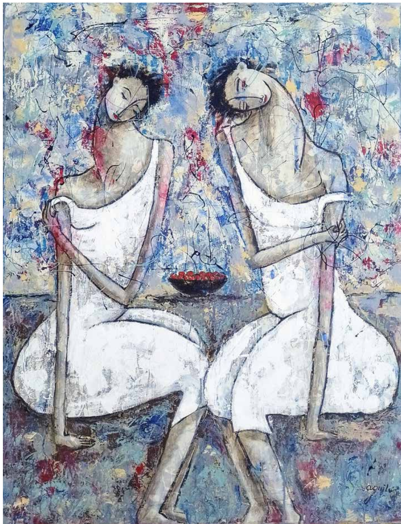
De la Serie Las Piadosas, acrylic on canvas, 90x70 cm año 2015

Q: What is the “rule” of art that you love breaking again and again?