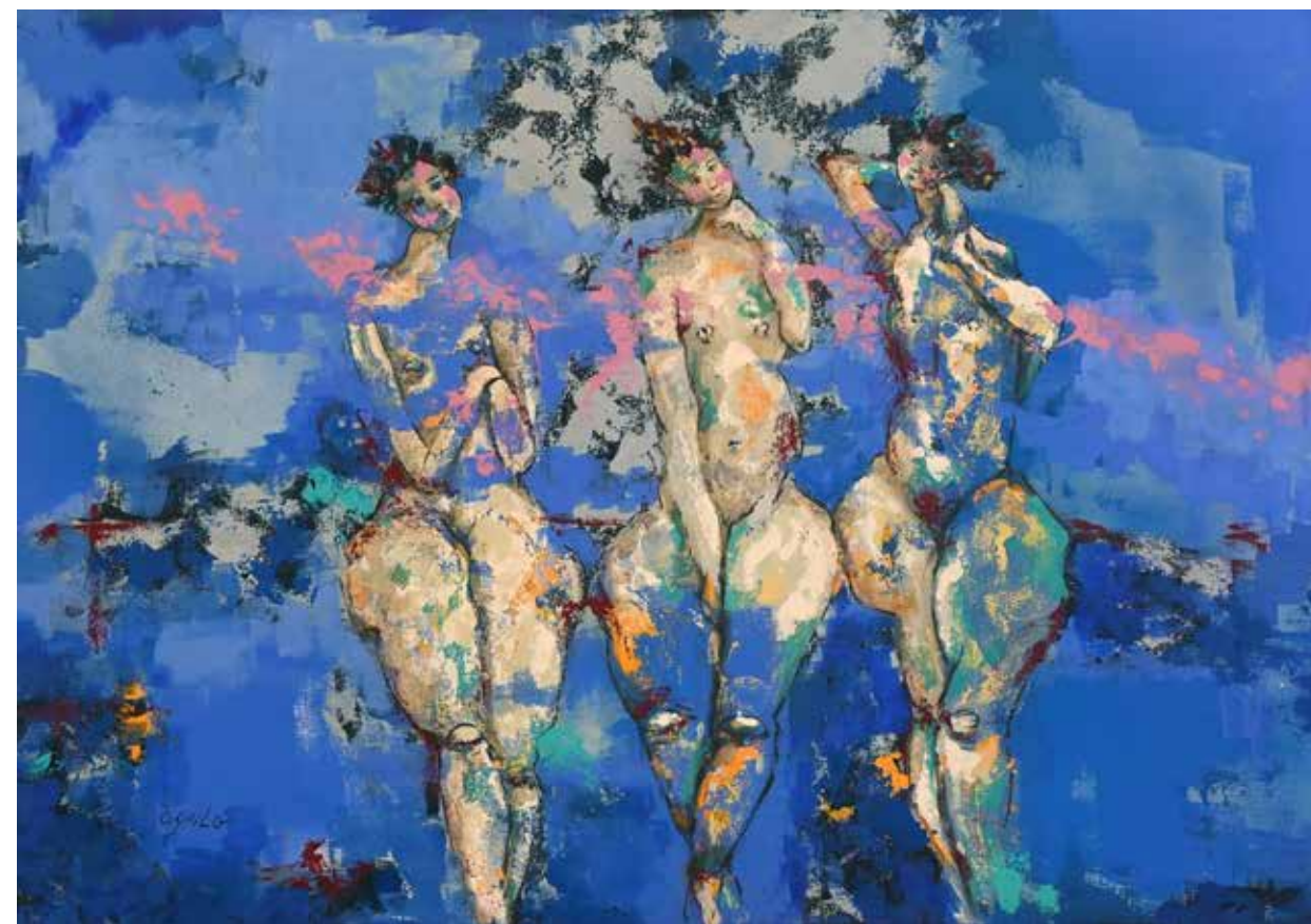
De la Serie Las Piadosas, acrylic on canvas, 70x100 cm. año 2024

In silence, I would wish for them to see the magnificence of the universe. I would want them to feel in their heart that humanity is, at its core, good, and that trust in one another is essential. I would hope they understood that hatred leads us nowhere, while generosity and kindness are what truly enrich our lives.