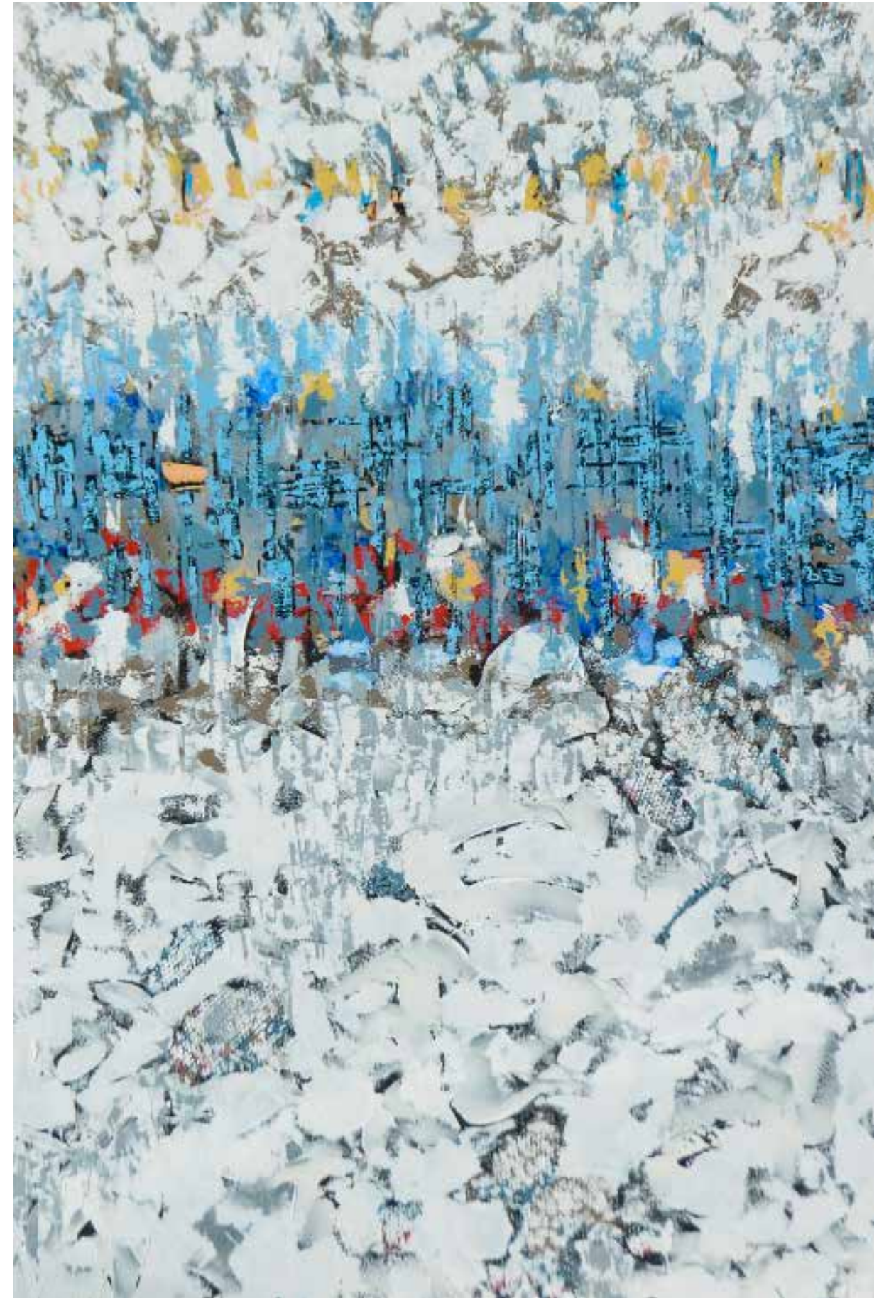
De la serie Ataraxia, acrylic and mixed media on canvas, 150x100cm. año 2019

In this series, she paints women that embody their various emotional states. The expressions of their bodies and the textures of their backgrounds create an atmosphere of spiritual sensuality. She develops a pleasurable play that satisfies our need for eternal beauty.