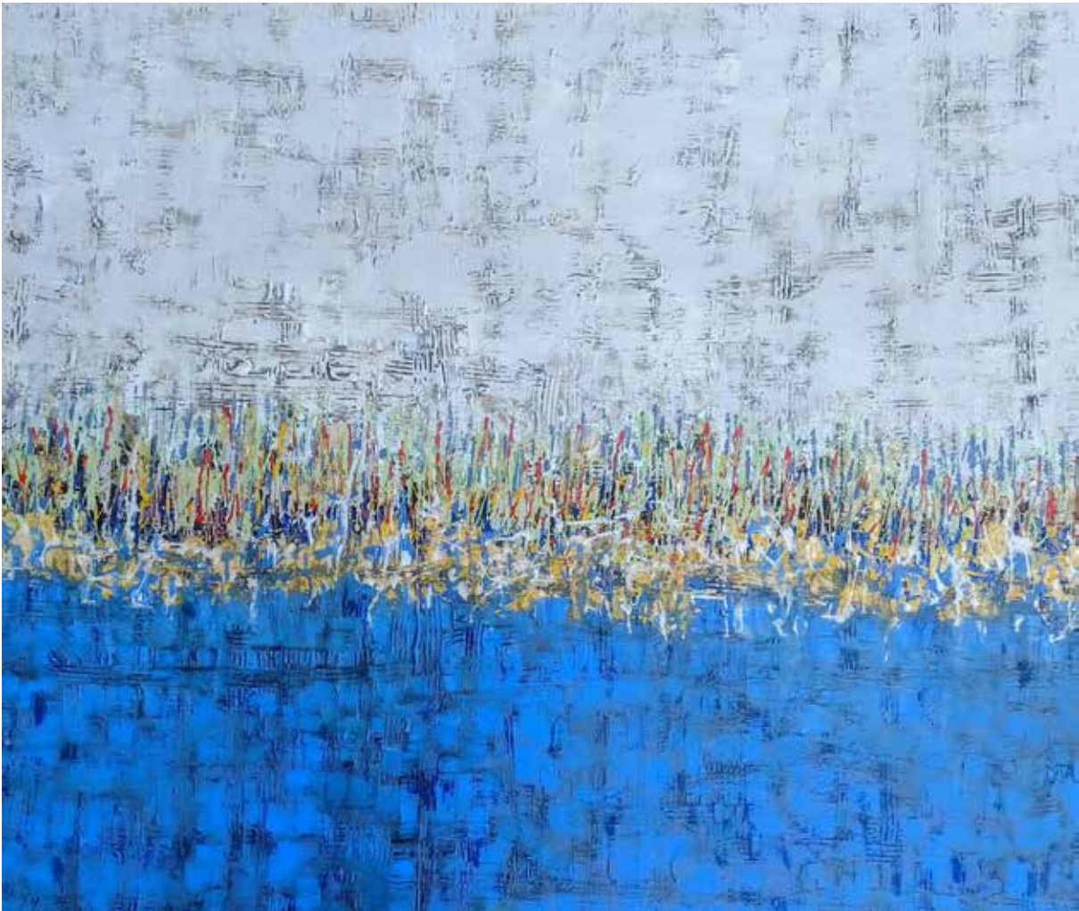
De la Serie de Faros y Mar, acrylic on canvas, 100x120 cm. año 2022