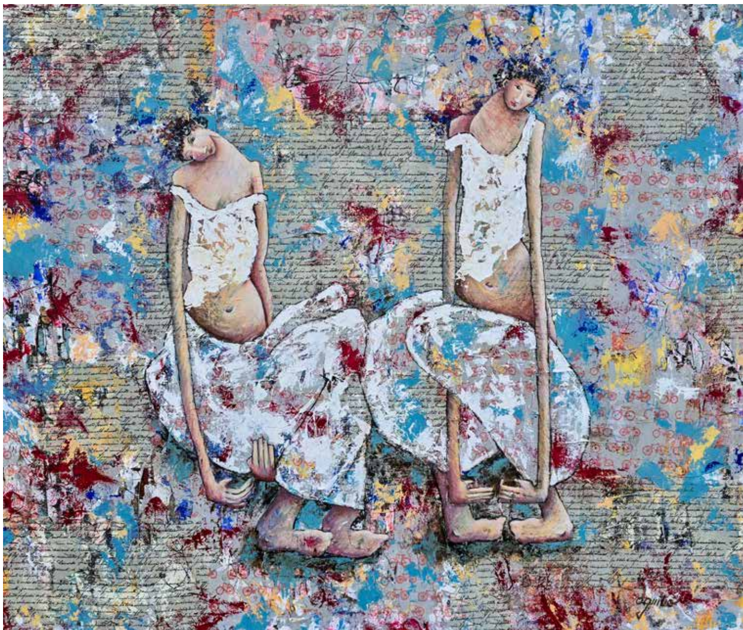
De la serie Las Piadosas, acrylic on canvas, 90x110 cm año 2022