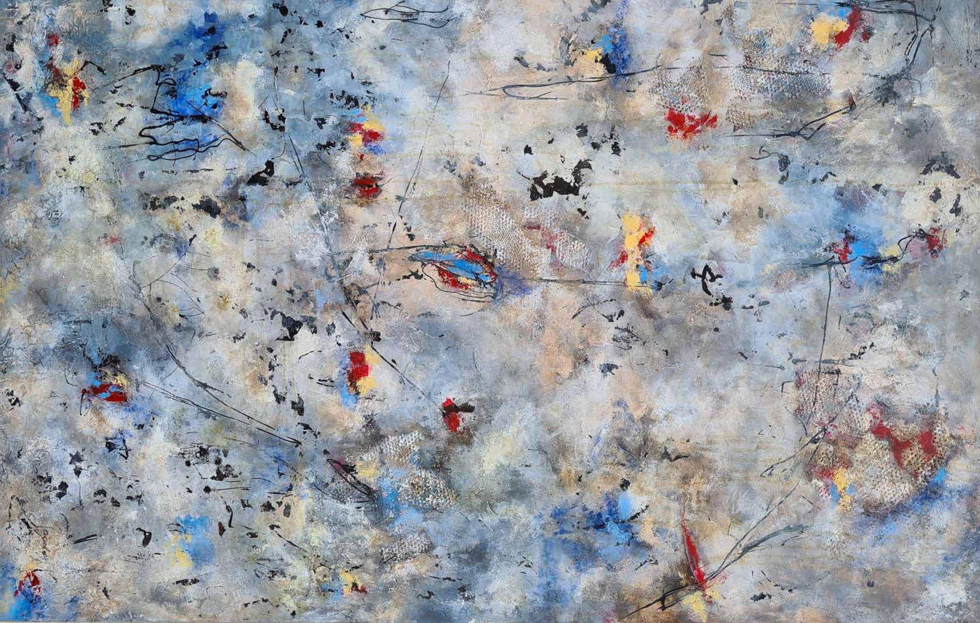
De la Seria Ataraxia, acrylic on canvas, 150x100 c. año 2019